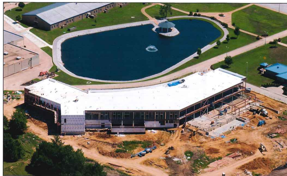
The Golden Triangle campus Student Union is on track to open for the fall semester of 2016.

With the influx of highly automated manufacturing processes to the Golden Triangle, the need has arisen for multiple tiers of employees to make these extremely complex systems work. There are the operators, currently being trained in our Workforce Services non-credit courses, the programmers, many of whom come from EMCC's Automation & Control Program, and a third tier that has been under-manned